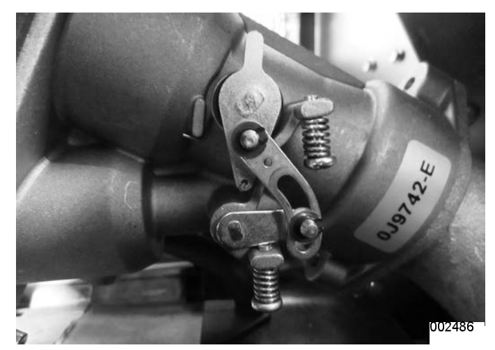
Figure 2-14. Stepper Motor Closed – Closes Both Venturis