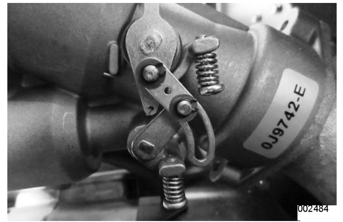
Figure 2-12. Stepper Motor Starting Position and/or Mid-point